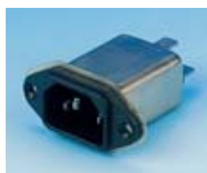
Panel cut out=28.5 x 21.5, FC=40, Tabs 6.3 x 0.8 Depth behind panel=34.4 + Tabs